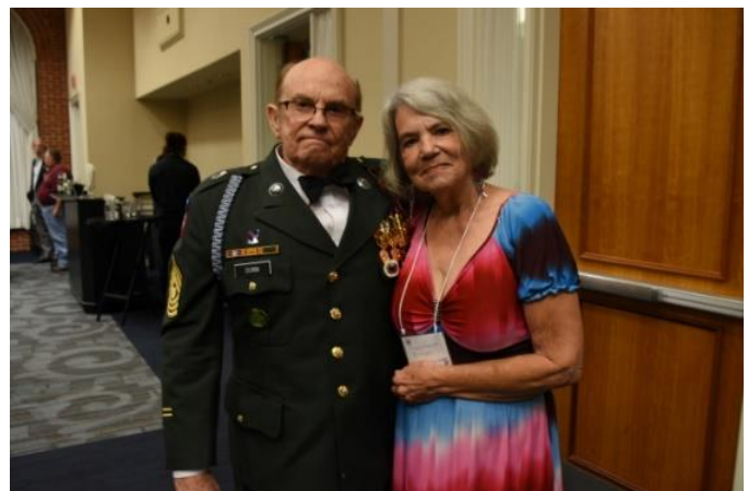
Rock Merritt Items were Honored and Valued during the Silent Auction.